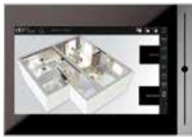
TZ10 - B