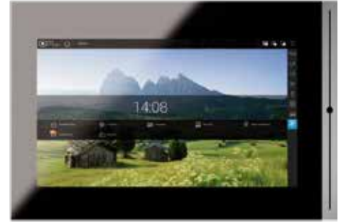
TZ19 - B