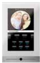
TZ07 - W