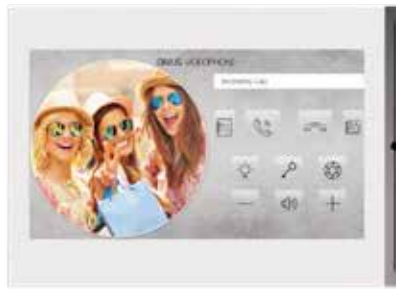
TZ15 - B