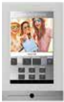
TZ07 - W