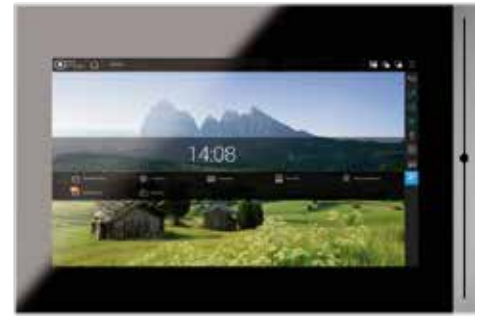
TZ19 - B