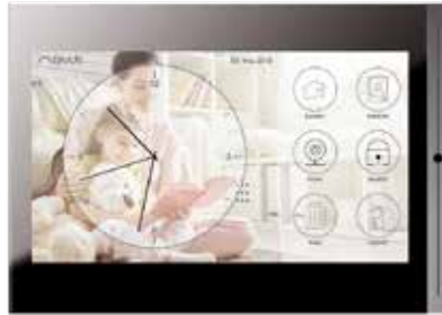
TZ15 - B