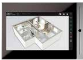
TZ10 - B